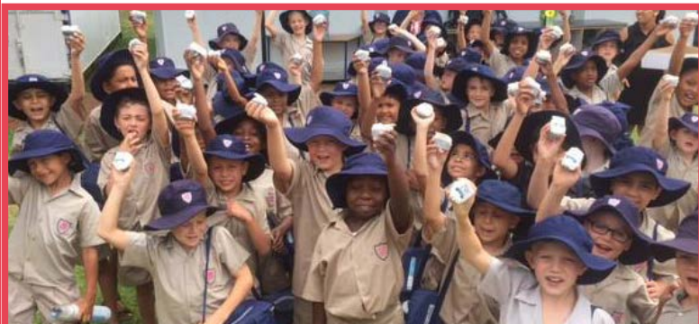
On Friday 26 January the boys and staff were treated to a Centenary cupcake to launch the Centenary logo.